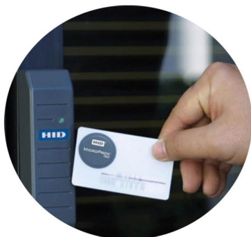
Access Control and Alarm Systems