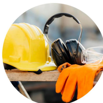
Occupational Health and Safety