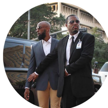
Executive Protection Services