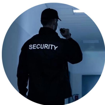
On-Site Security Personnel (Corporate and Combat)