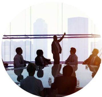
Security Consulting and Risk Assessment