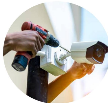
Video Surveillance and Remote Monitoring