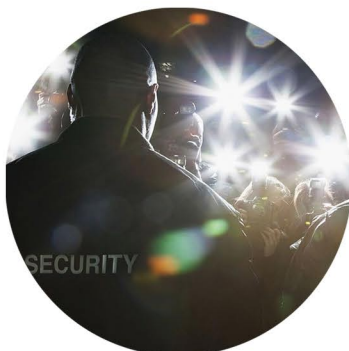
Event Security Management